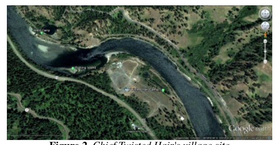
Figure 2. Chief Twisted Hair's village site Twisted Hair's camp area was just <sup>1</sup>/<sub>4</sub> mile upstream from Orofino on an island that is now part of the southern bank of the Clearwater River, see Figure 2. The area has been modified quite a bit as it was the site of a lumber mill and other activities during the first three-fourths of the 20th century.

When Clark arrived he had to wait for Twisted Hair to come from a fishing island, which was probably the small island below the village site. This can be confusing as to which journal entry you read. Some reason that Twisted Hair's camp was on the north side of the river and when Clark arrived he came from his village on an island. Others (including this writer) think that Clark & guide must have crossed to village site when it was an island and then the guide called to Twisted Hair who was fishing on a smaller island. When the whole expedition arrived a few days later they camped downstream on an island on the north side of the river. That island has since been connected to the north bank by the railroad that built through the area in the late 1890s.