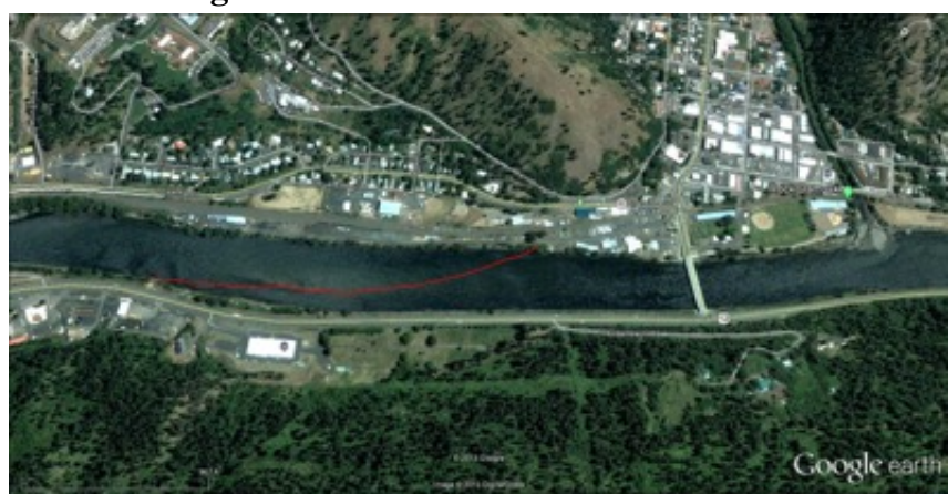
Figure 4. The river crossing was a major point in travel. Google Earth image dated 2003, before Clearwater Crossing RV park was built.

In Figure 4, the red line is the route of river crossing used by the Nez Perce, the Corps of Discovery and by early white settlers until the first bridge was built. Today the upper end is marked by a statue at the entrance to Clearwater Crossing RV Park and the lower end emerged just above the airport. The Google Earth image was taken with moderately high water, so the sand bars and islands that make the crossing are not visible. In September they are very visible.