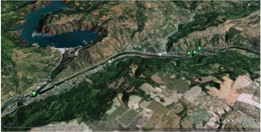
Figure 1. Bird's Eye view of the Orofino area.

The Corps of Discovery first entered the Orofino area when Capt. Clark accompanied by three expedition members arrived late in the evening of September 21, 1805 at Twisted Hair's camp just up river from Orofino. The next day they returned to Weippe area and then returned with the whole expedition on the 24th. By the 25th many men were sick. Clark, with Chief Twisted Hair and two young Nez Perce men headed down river to hunt trees "Calculated to build Canoes." They traveled down the north side of the river to mouth of the North Fork.