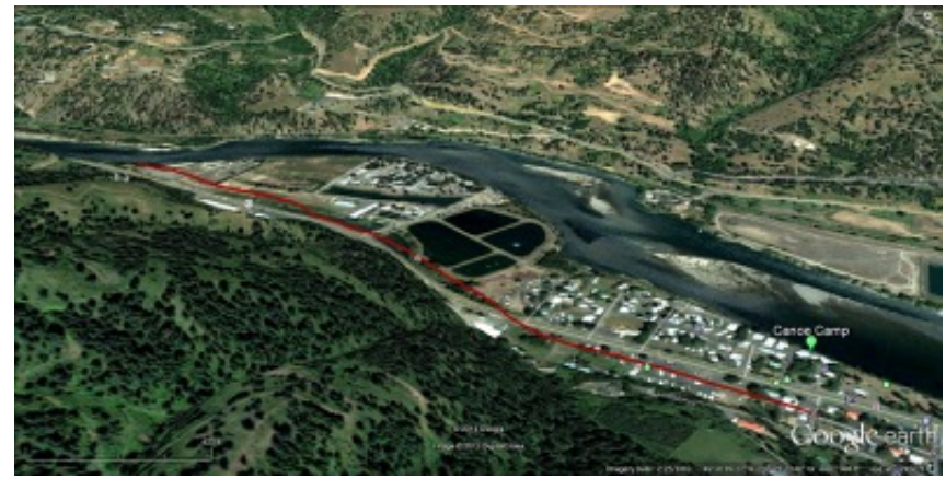
Figure 7. The probable route of the slough and route of the canoes out from Canoe Camp.

The journals record that they were able to see up the North Fork some distance. This has led some people to speculate that their camp was a little further west that where the designated "Canoe Camp" public park is today. Town legend is that the Corps of Discovery cut their canoe trees "behind" camp. At that time there was a slough, or wet area behind the natural levy that provides the open park like setting at today's Canoe Camp. When the state highway built through this area in the 1930s they removed the stumps of the "Canoe" trees over the objections of local residents. Much of the slough or wet area has been filled but you can still see some low lands just west of Canoe Camp RV Park on the south side of the highway. See Figure 7. It is likely that the canoes were built in or adjacent to this slough, loaded in the water there, and the Expedition entered the main river near today's "Pink House Hole" campground. White man has greatly modified the landscape here in the last 70 years for farming, homes and sewer treatment ponds.