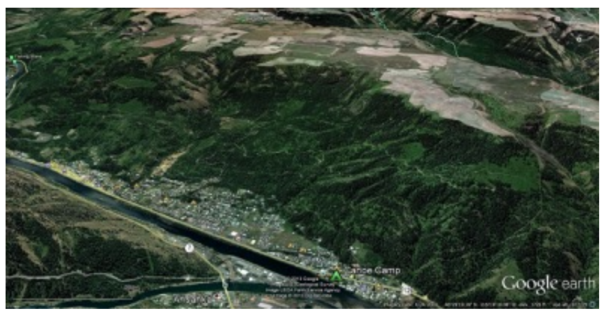
Figure 8. Looking from the north side of the

The journals record that they were able to see up the North Fork some distance. This has led some people to speculate that their camp was a little further west that where the designated "Canoe Camp" public park is today. Town legend is that the Corps of Discovery cut their canoe trees "behind" camp. At that time there was a slough, or wet area behind the natural levy that provides the open park like setting at today's Canoe Camp. When the state highway built through this area in the 1930s they removed the stumps of the "Canoe" trees over the objections of local residents. Much of the slough or wet area has been filled but you can still see some low lands just west of Canoe Camp RV Park on the south side of the highway. See Figure 7. It is likely that the canoes were built in or adjacent to this slough, loaded in the water there, and the Expedition entered the main river near today's "Pink House Hole" campground. White man has greatly modified the landscape here in the last 70 years for farming, homes and sewer treatment ponds.