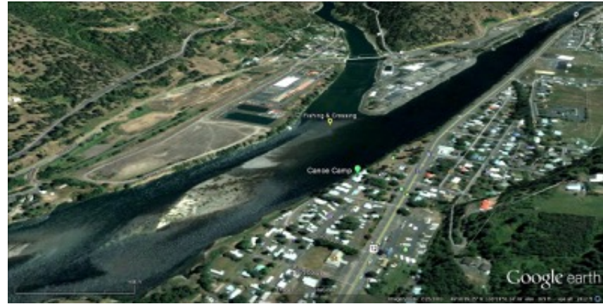
Figure 6. Looking up the North Fork from Canoe Camp.

For the Nez Perce, the river not only provided food, but it was a major transportation route. Clark also recorded that one of the Indian Canoes with 2 men with Poles Set out from the forks at the Same time I did and arrived at our Camp on the Island within 15 minits of the Same time I did, not withstanding 3 rapids which they had to draw the Canoe thro'... This distance is about 5 miles and would have taken about one & half hours on horseback. Today the only boats that go up river are modern jet boats and it takes nearly as long to travel the route.